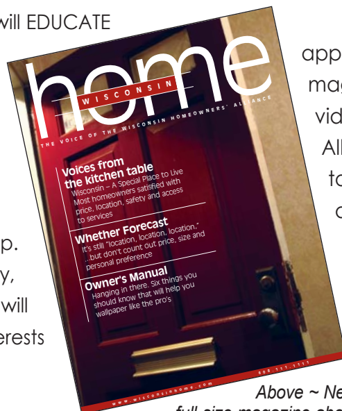
Above ~ New full-size magazine about Wisconsin home and property ownership

Advocacy efforts include meeting with officials, and occasionally mobilizing WRA members and the public when an issue impacts home ownership or private property rights.